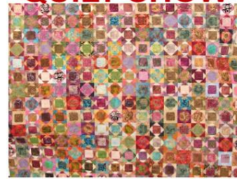
Batik Explosion Raffle Quilt King Size