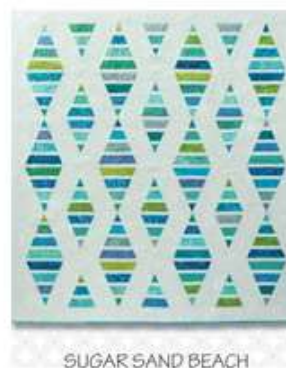
SUGAR SAND BEACH

Birch Tree Quilt – Using Beth's Design and Technique Make a Unique Quilt, all levels and experienced beginners