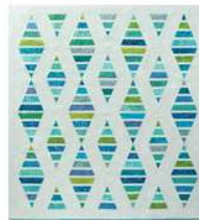
SUGAR SAND BEACH

Birch Tree Quilt – Using Beth's Design and Technique Make a Unique Quilt, all levels and experienced beginners