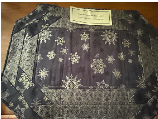
Placemat workshop with Lynn Price