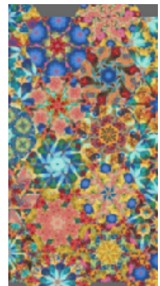
One Block Wonder with Krista Zaleski